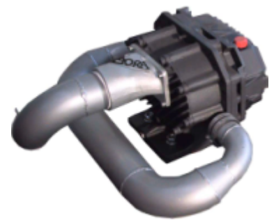
BORA103 AC-K detail

Evolution of dry vacuum AC pump idea that emphasizes 103 series advantages with VOLUMETRIC + CENTRIFUGAL CYCLES optimizing the efficiency at 3000 RPM